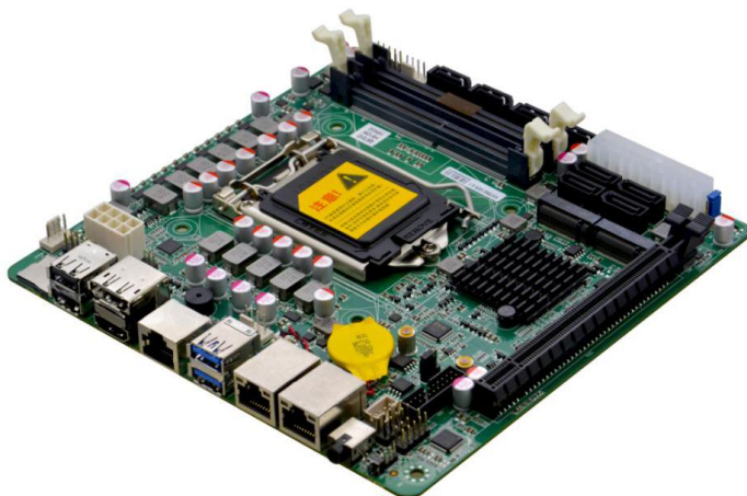
H570S6 VER:0.1 Lateral View