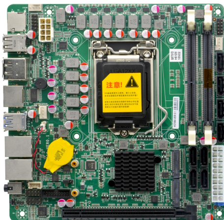
H570S6 VER:0.1 Front View