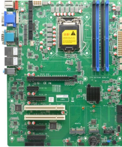
H570VM VER:1.0 Front View