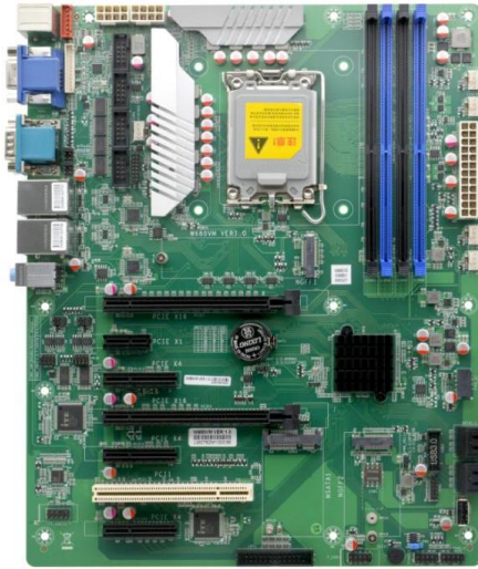
W680VM VER:1.0 Front View